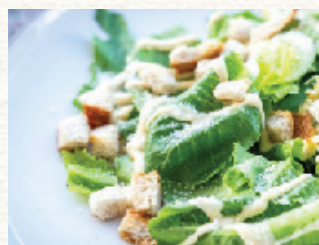
6. Vegetarian Caesar Salad