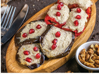
1. Imereti $16.20

Fried eggplants and red bell peppers covered with a delicate walnut sauce