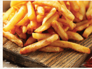
3. French Fries $6.50