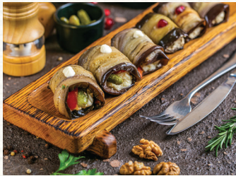
5. Saocari $16.00

Wrapped fried eggplants with cream and garlic sauce, pickles and sliced tomatoes