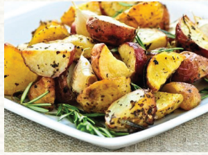
2. Fried Potatoes in Ukrainian Style $8.50