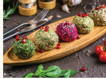
3. Assorted Pkhali $23.50

Boiled beet, spinach, leek, beans and eggplant with georgian spices and cilantro 5pc