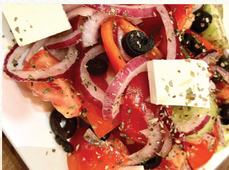
3. Greek Salad

Spring mix, smoked deli turkey, mayo dressing and hard cheese