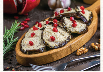
4. Badrijani $15.80