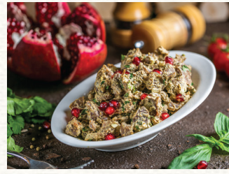
7. Kuchmachi $16.30

Tender pan-fried chicken covered in a walnut sauce