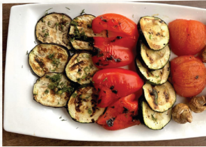
5. Grilled Vegetables $11.50