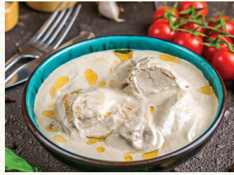
6. Baje $17.50

Wrapped fried eggplants with cream and garlic sauce, pickles and sliced tomatoes