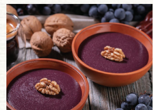
3. Pelamushi $8.00