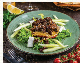
4. Salad "Iveria"

Spring mix, fried beef and vegetables with a mayo and adjika dressing