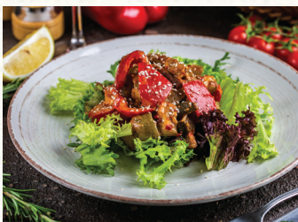
1. Salad "Tiflisi"