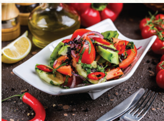
2. Georgian Salad

Fried chicken liver, tomatoes, cucumbers, feta cheese, lettuce salad mix and dressing "Iveria"