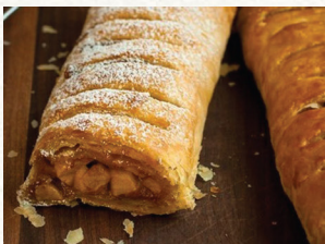
1. Strudel Pie $9.50