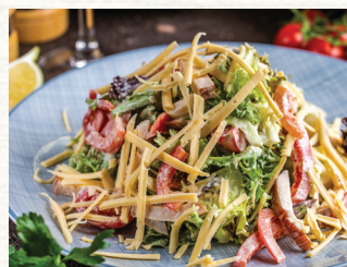
5. Smoked Turkey Salad