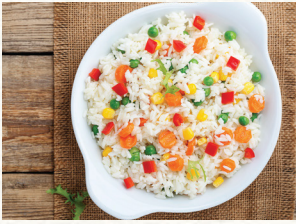
1. Rice with Vegetables $7.50