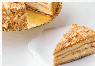
2. Cake "Napoleon" $10.50