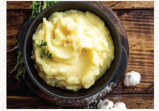
4. Mashed Potatoes $9.00