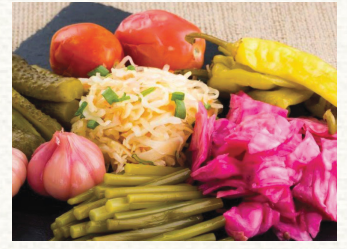
8. Marinated Vegetables $14.80

Boiled chicken gizzard mixed with walnuts and cilantro